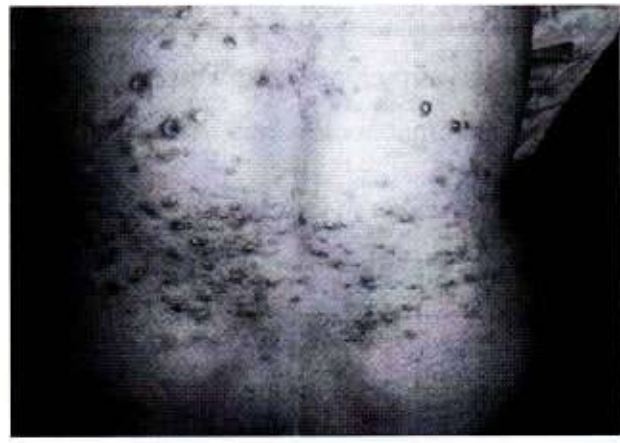
Fig.2. After 7 days