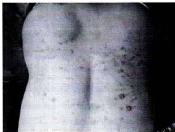
Fig.3. After 28 days

52year old man presented with 1.5 month history of pruritic cutaneous lesions that had not resolved after treatment with oral antihistamines and topical fluocinolone ointment. He had no other symptoms and was otherwise well. His medical history was irrelevant.